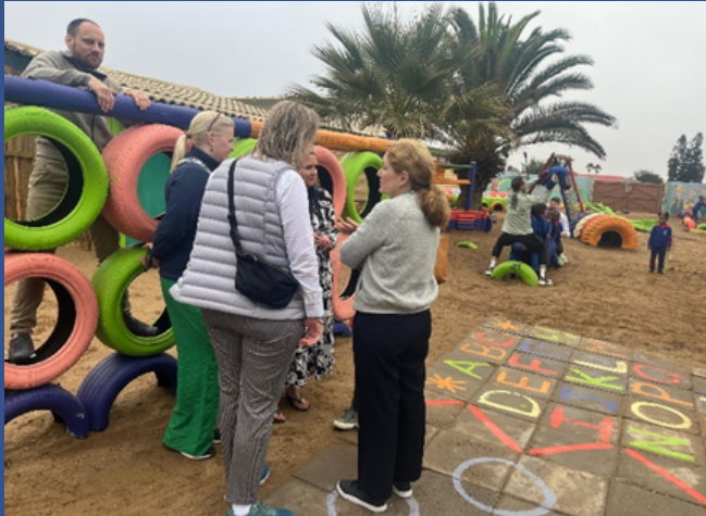
Site 1. Swakopmund Primary School

The Postcode Lottery Visit (9-10 April 2024): The Postcode Lottery Group is a social enterprise, 100% owned by a foundation, that contributes to a healthier, fairer, greener world. It started in 1989 with the Nationale Postcode Loterij in the Netherlands with the goal of contributing to a better world through the operation of charity lotteries. Its sole objective is to support charitable and social initiatives worldwide. The two-day visit to the School Readiness Initiative in Namibia included a visit to Lifeline/Childline Offices, a site visit to Dina Preschool in Hakahana Informal Settlement, and a Q&A dinner in Swakopmund. The second day featured visits to Swakopmund Primary School, Hildegardt Early Childhood Development Centre, and meetings with regional officials.