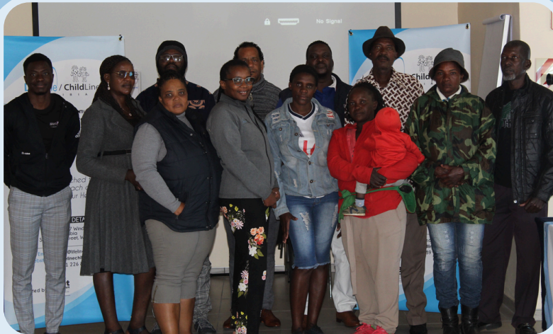
BFTW Project Close-Out Stakeholders in Khomas Region (Windhoek) that took place on the 28th May 2024 at Lifeline/Childline Namibia