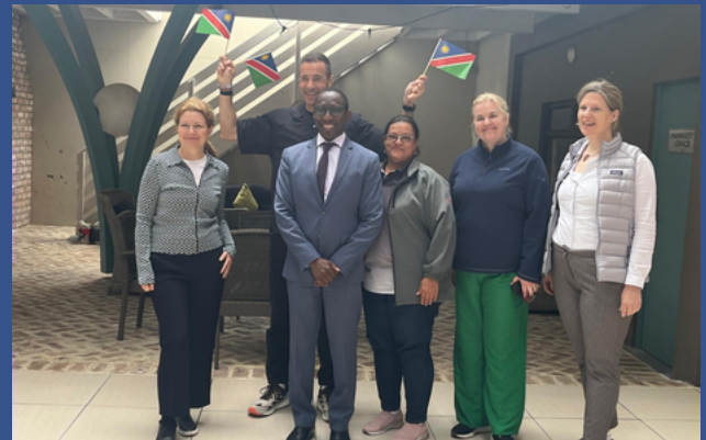
3. Meeting with Regional Governor