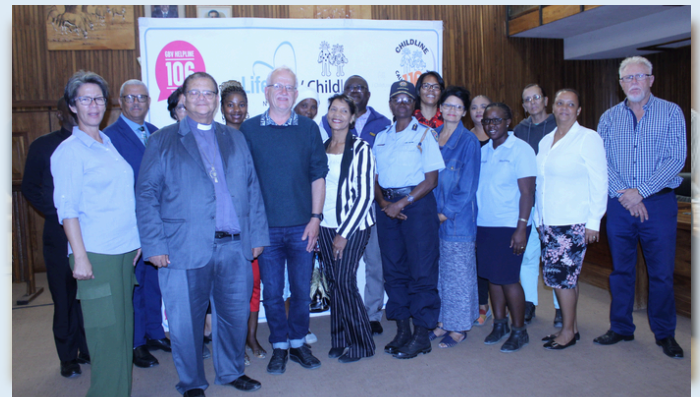
2BFTW Project Close-Out Stakeholders Engagement for Hardap (Rehoboth), that took place on the 27th May 2024 at the Rehoboth Town Council Chambers

These engagements aimed at providing feedback to stakeholders on the measures when it comes to how closely the project met community's needs, what worked well on the project and what needs improvements.