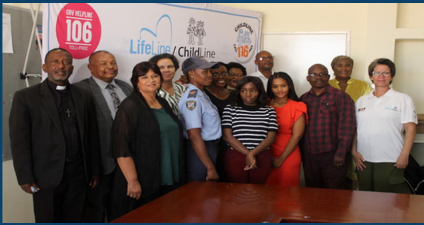
BFTW Project Close-Out Stakeholders Engagement for Hardap (Mariental), that took place on 14th May 2024 at the Hardap Regional Council.